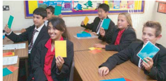
Pictured are Cardiff High School Year 8 pupils on the Thinking for Learning course. They are using a 'traffic light' system, holding up green to show they understand the question, yellow to say they are not sure and red to indicate that they do not understand.

It was set up following years of research and staff professional development training, partly funded